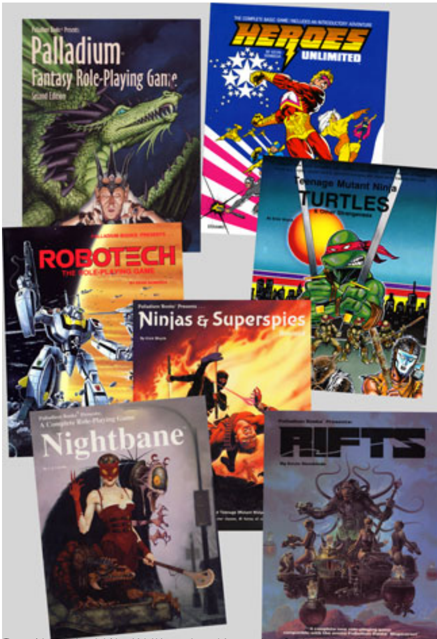
Copyright © 1998 by Palladium Books, Inc. All rights reserved. Palladium Fantasy Role-Playing Game , HEROES UNLIMITED , Teenage Mutant Ninja Turtles , ROBOTECH , Ninjas & Superspies , Nightbane , and RIFTS are trademarks of Palladium Books, Inc. All other trademarks are the property of their respective owners.