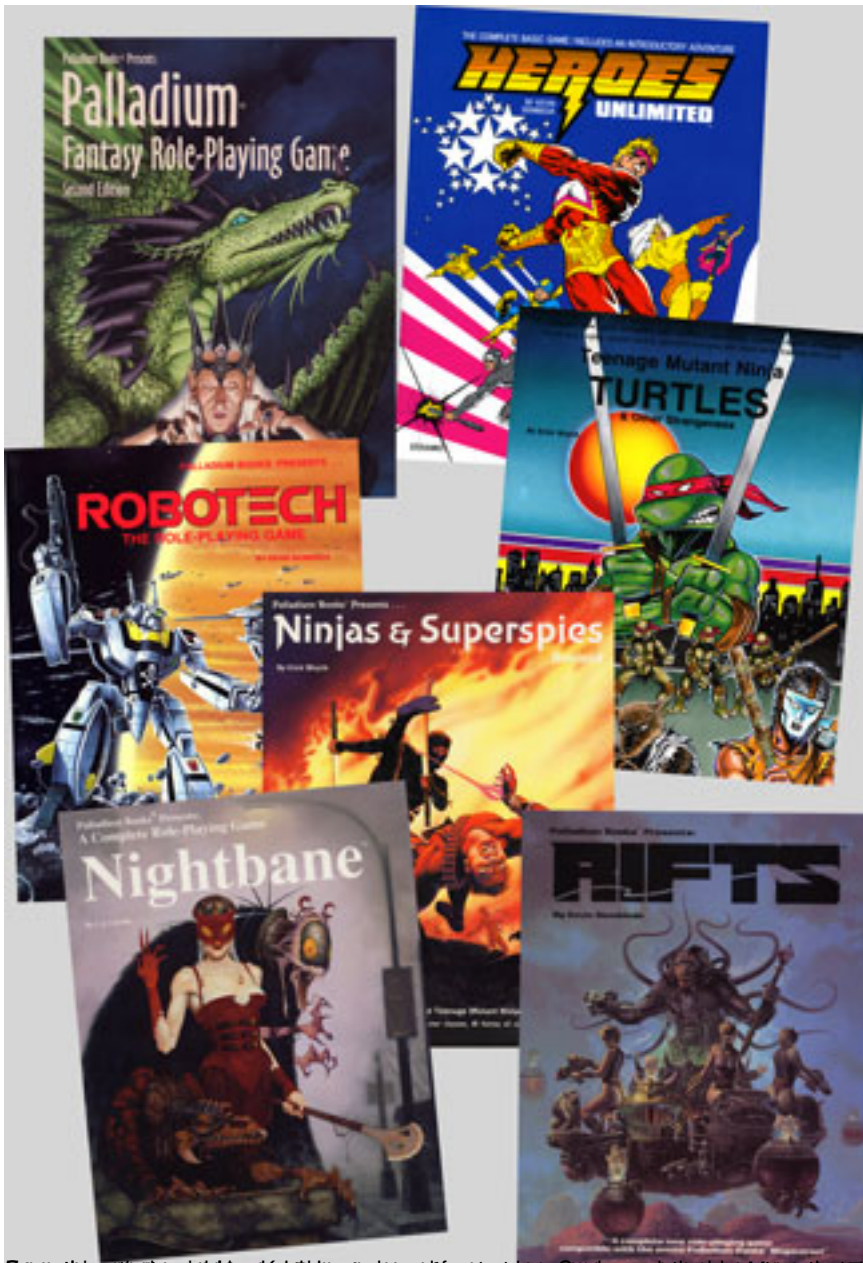
Palladium Fantasy Role-Playing Game HEROES UNLIMITED Teenage Mutant Ninja Turtles ROBOTTECH THE ROLE-PLAYING GAME Ninjas & Superspies Nightbane RIFTS Rifts® and Hollywood